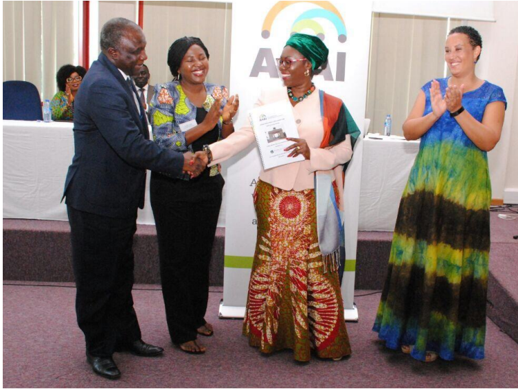
Minister Ursula Owusu- Ekuful, Communications Minister accepts report on Ghana Infrastructure sharing study